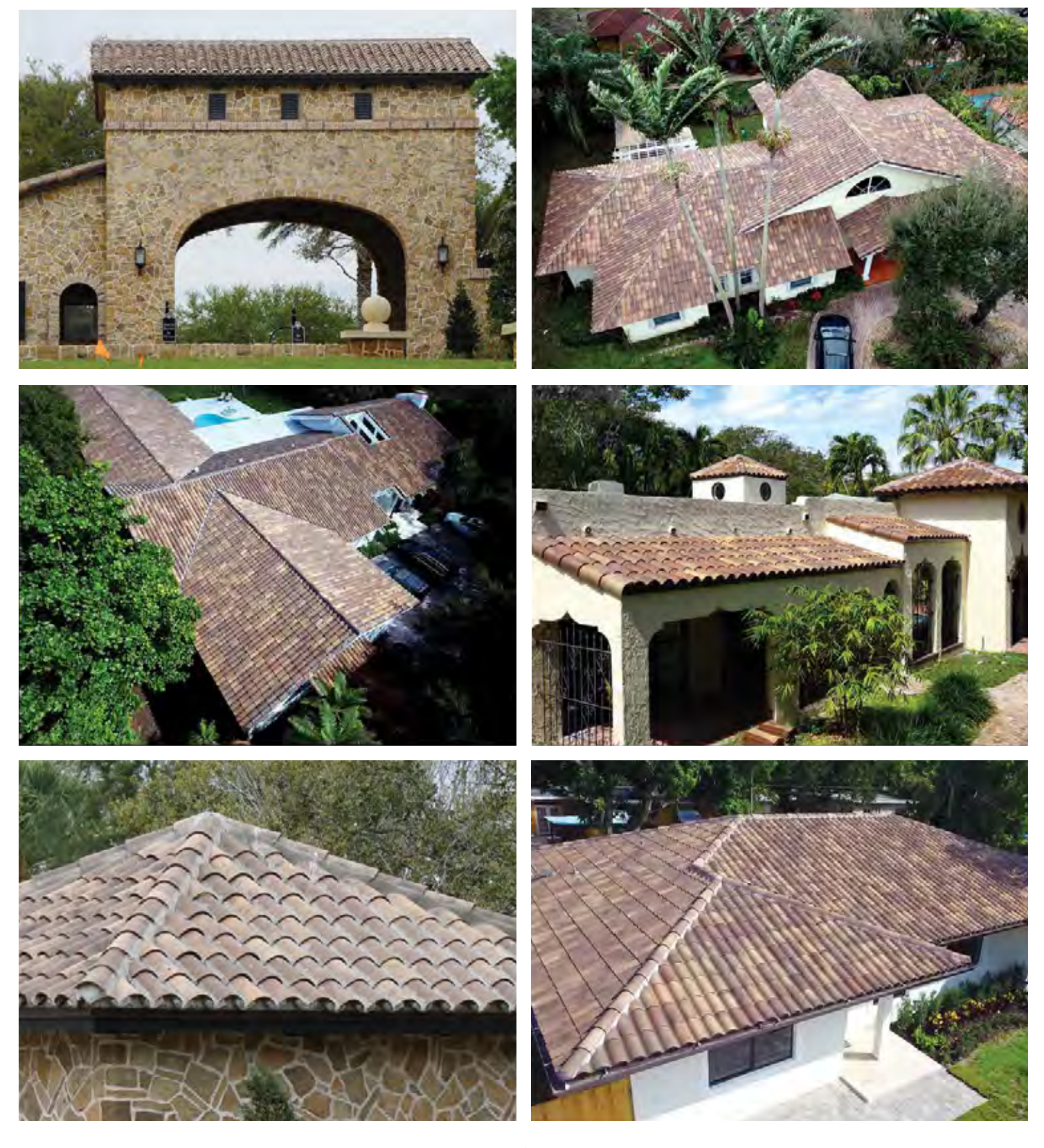
Available in: Spanish S or Barrel (COVERS ONLY) Recommended Pans: Brown or Graphite

This is our darkest preblend and is made to mimic the centuries old roofs seen along the "Camino de Santiago" in Spain.