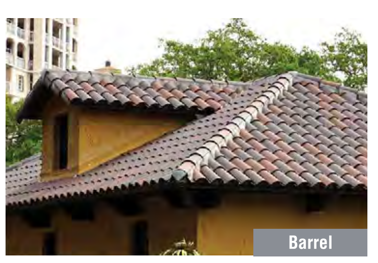
Covers: 67% Graphite, 33% Brown Pans: 67% Graphite, 33% Brown