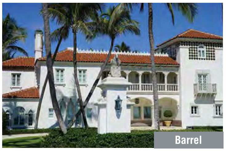
Covers: 70% Vintage, 30% Añeja Pans: 50% Red, 50% Brown