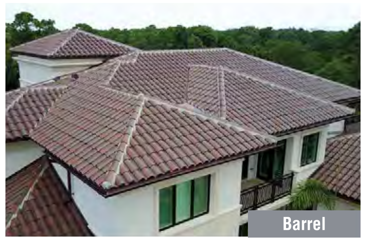
Covers: 80% Graphite, 20% Fume Pans: 100% Graphite