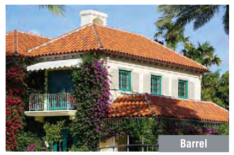
Covers: 40% Red, 30% Ohio Red, 30% Vintage Pans: 100% Red