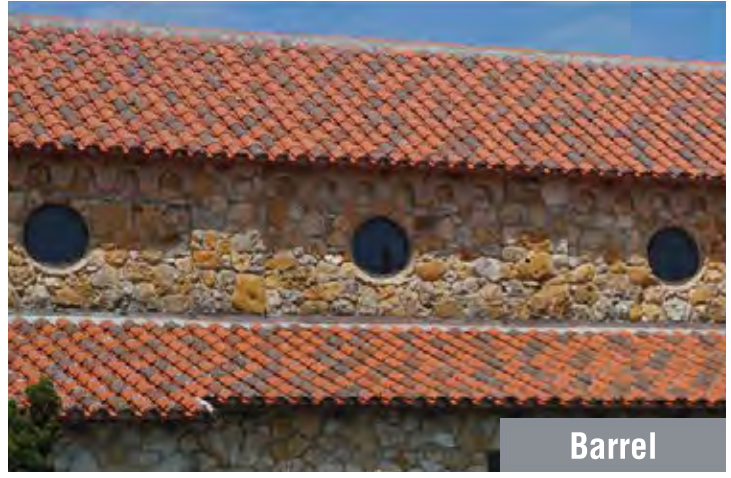
Covers: 60% Red, 20% Brown, 10% Fume, 10% Graphite Pans: 100% Red

Covers: 25% Red, 25% Brown, 25% Graphite, 25% Vintage Pans: 33% Red, 33% Brown, 33% Graphite